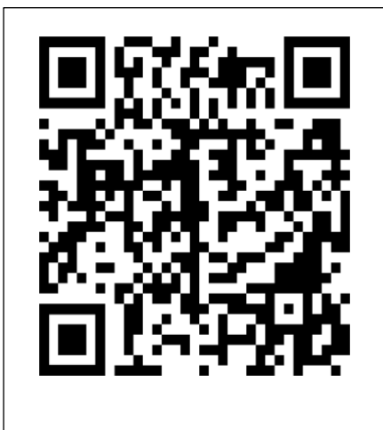
Figure 1- Scan the QR Code to download the textbook