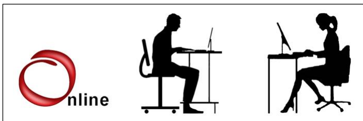
Figure 3: Discuss Group

This is an 8-week course; the discussion must be completed by 5 pm on 1/23/2026.