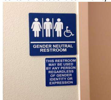
Door sign of a gender-neutral restroom.

They are three: two are inside the Writing Center and the third one is next to the elevator between the Nursing Education Center and Student Community Center.