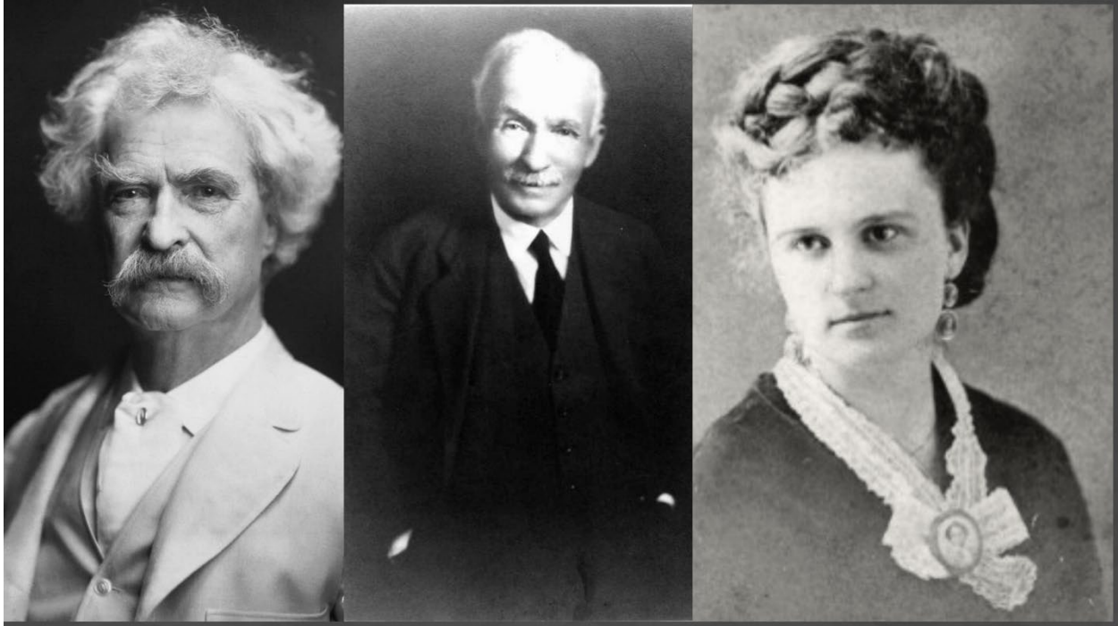
Figure 1. From Left: Mark Twain, Charles Chesnutt, Kate Chopin