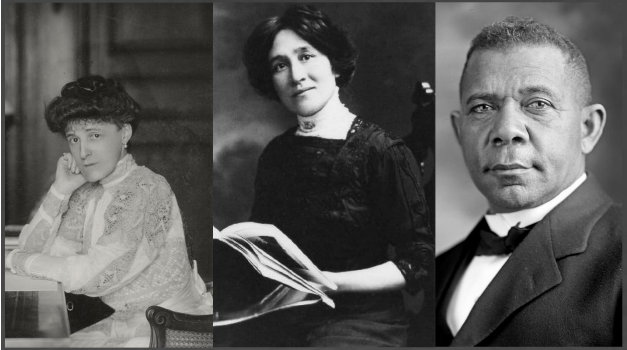
Figure 3. From Left: Edith Wharton, Sui Sin Far , and Booker T. Washington