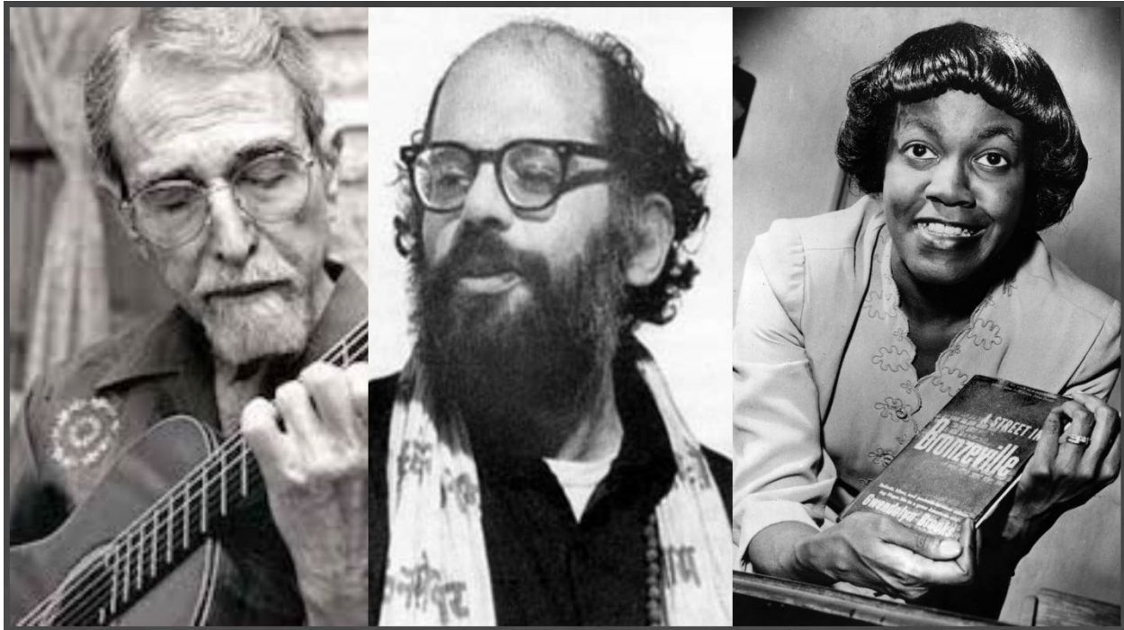
Figure 6. From left: Américo Paredes, Allen Ginsberg, and Gwendolyn Brooks

Boost your success with our weekly Extra Credit Challenges! In each weekly challenge, you'll explore a short reading or video on a proven strategy to help you lower anxiety, stay organized, manage your time, limit distractions, and avoid last-minute cramming. Your challenge is to try out the activity during the week and submit a short reflection to earn 3 extra credit points. You can complete every challenge (up to 48 extra credit points total!) or choose the ones that match the skills or habits you most want to strengthen. You'll find the Extra Credit Challenges linked in each week's module.