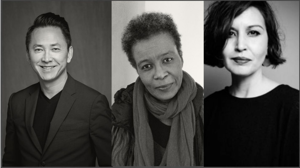
Figure 9. From left: Viet Thanh Nguyen, Claudia Rankine, and Layli Long Soldier