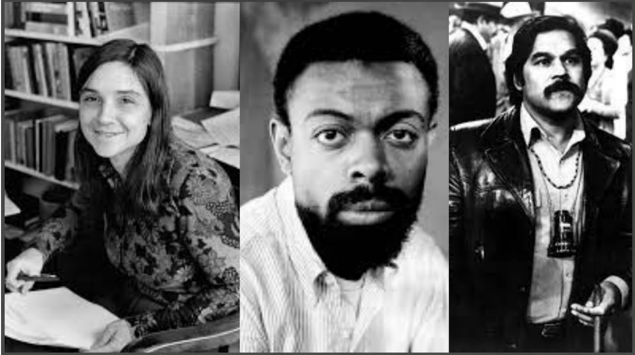
Figure 7. From left: Adrienne Rich, Amiri Baraka, and Luis Valdez