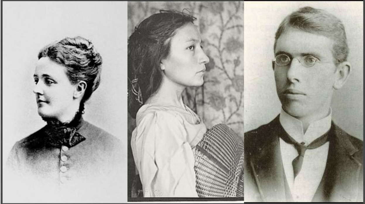
Figure 2. From Left: Sarah Orne Jewett, Zitkála-Šá, and Theodore Dreiser