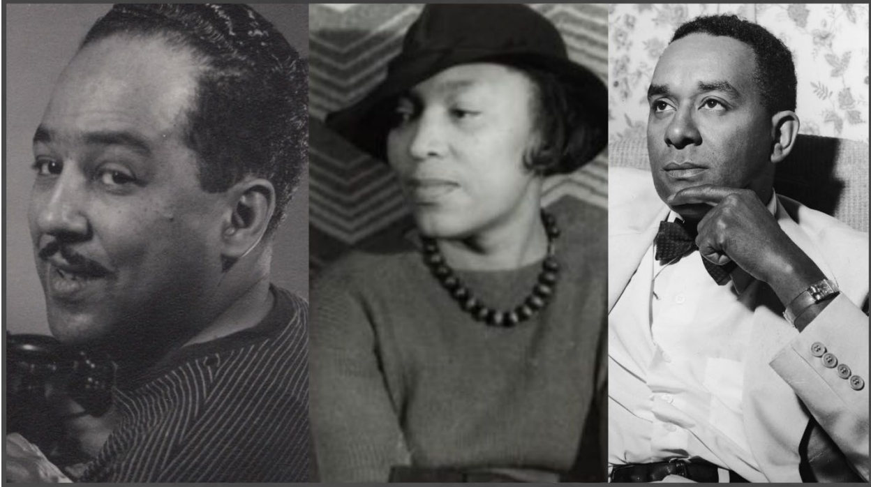
Figure 5. From left: Langston Hughes, Zora Neale Hurston, and Richard Wright