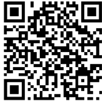
Academic Integrity Policy

Having academic integrity is paramount to your success in any class. Plagiarism or cheating is not tolerated. Any instance of this will result in a grade of zero for that assignment. Here is the link to the UNM Academic Dishonesty Policy: