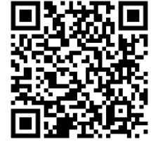
Title IX Policy

In an effort to meet obligations under Title IX, UNM faculty, teaching assistants, and graduate assistants are considered “responsible employees.” by the Department of Education http://www2.ed.gov/about/offices/list/ocr/docs/qa-201404-title-ix.pdf ). This designation requires that any report made to a faculty member, TA, or GA regarding sexual misconduct or gender discrimination must be reported to the Office of Equal Opportunity and the Title IX Coordinator. For more information on this policy, https://policy.unm.edu/university-policies/2000/2740.html or scan the QR Code above: