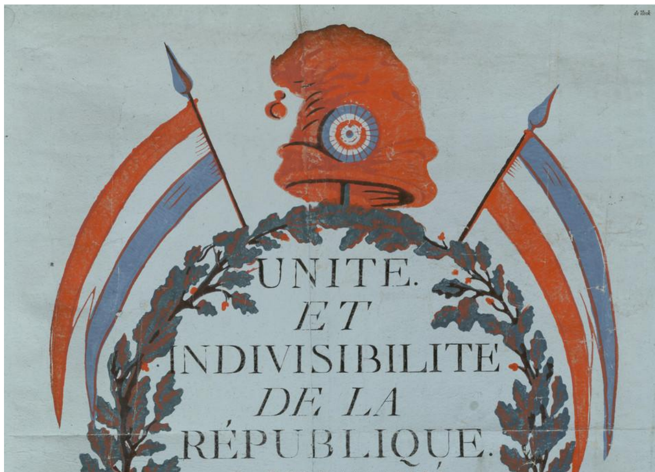
A poster produced in 1793 to promote the newly established French Republic.

Course: HIST 1160: Western Civilization II