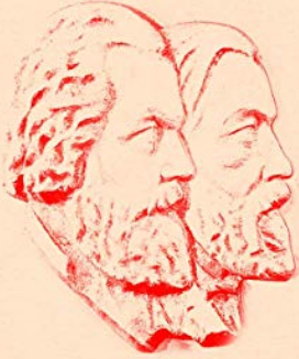
Karl Marx and Friedrich Engels

You will be reading Karl Marx and Friedrich Engels' The Communist Manifesto for the short essay assignments in this course.