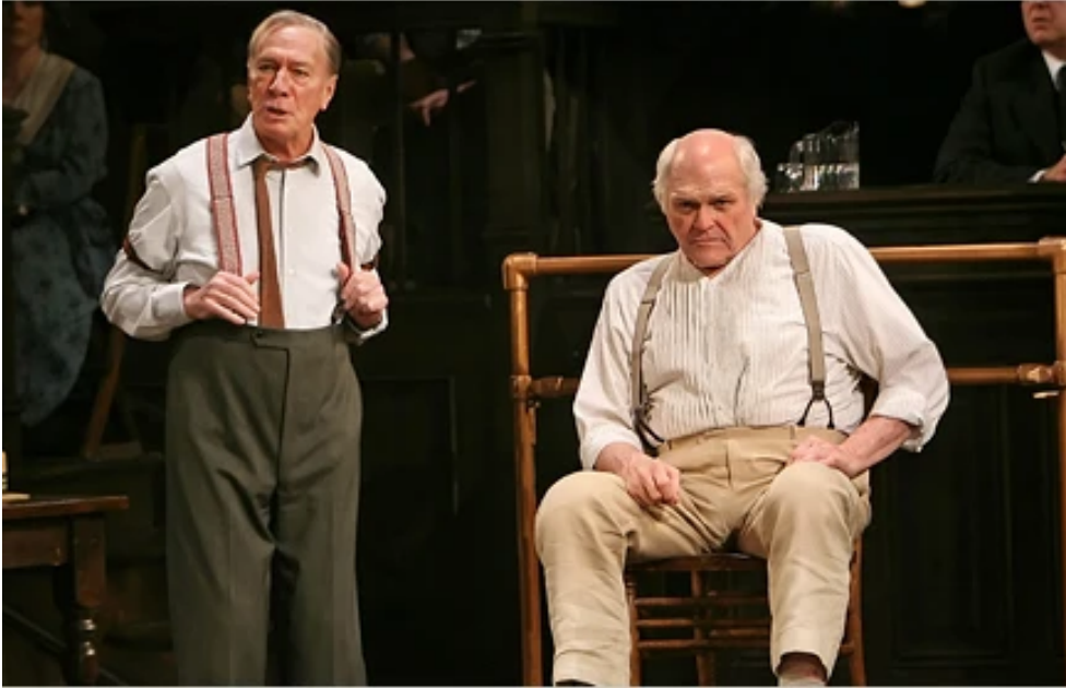
Christopher Plummer, left, and Brian Dennehy in a 2007 production of Inherit the Wind . You will be reading the script of this play for the short essay assignments in this course.

respond to another student's post. New threads that do not relate to the discussion prompt or responses to other postings that demonstrate minimum effort (e.g. "I agree with Bill") will result in 0 points. There are 5 points possible for your new thread and 5 points possible for your response to the posting of another student. Between the points for your new thread and the points your response there are a total of 10 possible points each week for your participation in online discussion. For further details on how your participation in the online discussion will be graded see the Online Discussion Grading Rubric document in the "Syllabus and Course Documents" folder found in the "Content" section of the course site.