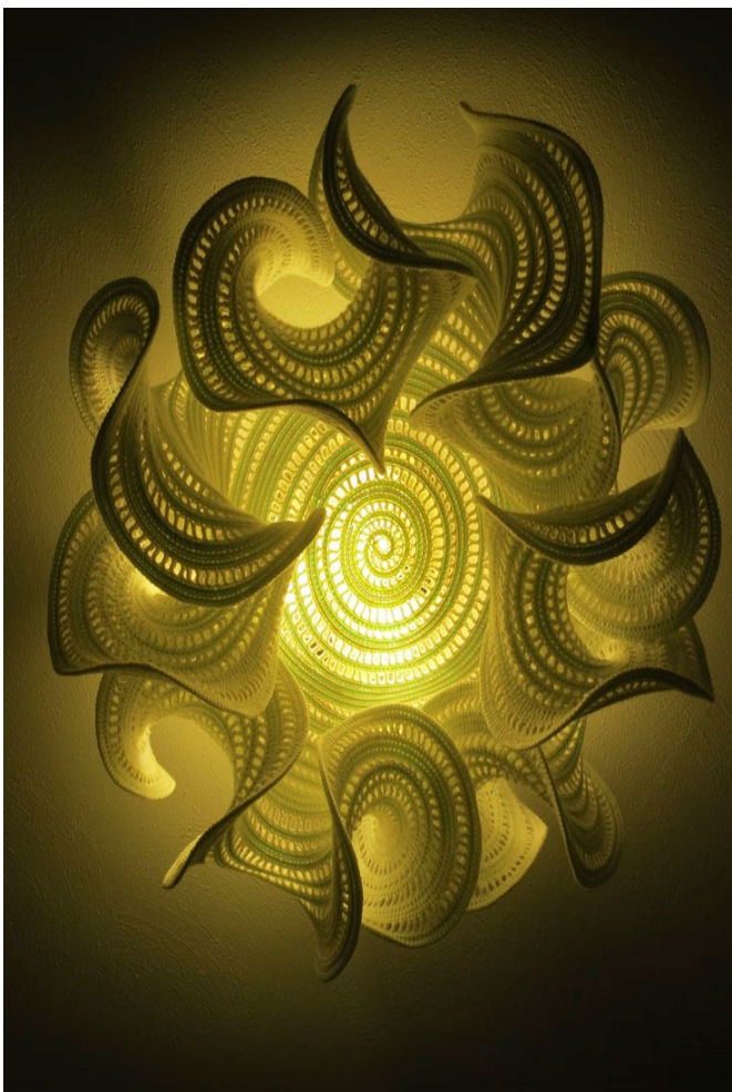
Hyperbolic Lamp Shade

Each unit will have a separate written homework and must be completed no later than the beginning of class as indicated on the outline. The purpose of the homework is to determine if you are understanding the concepts correctly. Homework that is illegible will not be graded. Each homework assignment is worth 25 points. Late homework may be graded. If graded, it receives a 15% penalty.