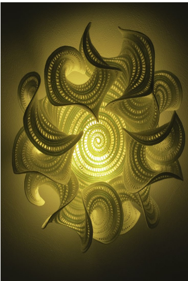
Hyperbolic Lamp Shade

There will be a maximum of four short worksheets (about every three weeks) available in the Math Center from opening Monday morning until closing Friday, and must be completed, checked and signed by a tutor, and turned in at the Math Center.