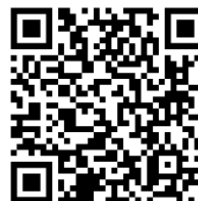
Title IX Policy

In an effort to meet obligations under Title IX, UNM faculty, teaching assistants, and graduate assistants are considered responsible employees. This designation requires that any report made to a faculty member, TA, or GA regarding sexual misconduct or gender discrimination must be reported to the Office of Equal Opportunity and the Title IX Coordinator. For more information on this policy, https://policy.unm.edu/university-policies/2000/2740.html or scan the following QR Code: