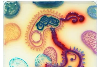
ASM Agar Art Contest https://asm.org/Events/ASM-Agar-Art-Contest/Home

“Pay attention in class and make sure to take good notes. Use those to study [from], they will do you wonders in this class.”