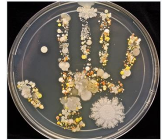
Hand print on a large TSA plate from my 8 1/2 year old son after playing outside.

Bring the knowledge that you have and take the journey with me as you continue reaching toward your educational goals.