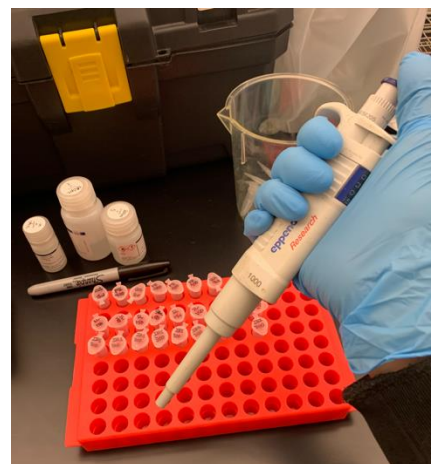
P1000 micropipette used to precisely transfer small volumes of liquids.