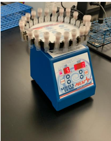
Lysis of bacterial cells to extract DNA using Vortex Genie Pulse.