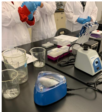
Setting up a Polymerase Chain Reaction (PCR) using bacterial DNA to start the process of identification.