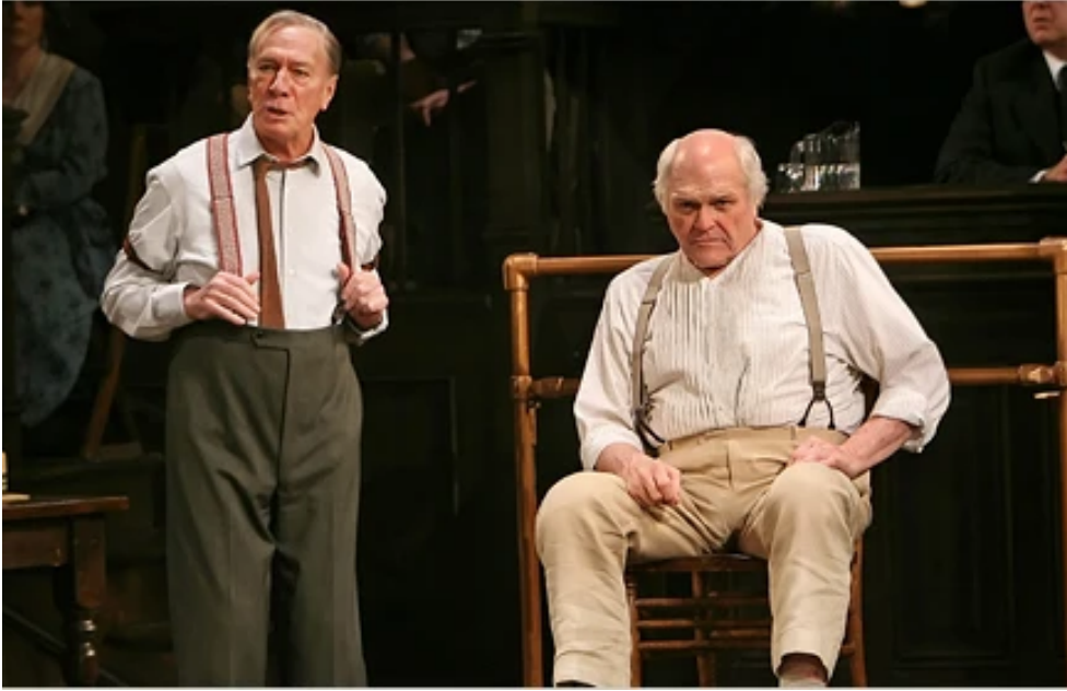
Christopher Plummer, left, and Brian Dennehy in a 2007 production of Inherit the Wind . You will be reading the script of this play for the short essay assignments in this course.

assignments described above is your initial post in each week's online discussion. Each week, your first post is due by 11:59 PM on Friday. You have until the end of the week (11:59 PM on Monday) to respond to another student's post. New threads that do not relate to the discussion prompt or responses to other postings that demonstrate minimum effort (e.g. "I agree with Bill") will result in 0 points. There are 5 points possible for your new thread and 5 points possible for your response to the posting of another student. Between the points for your new thread and the points your response there are a total of 10 possible points each week for your participation in online discussion. For further details on how your participation in the online discussion will be graded see the Online Discussion Grading Rubric document found in the weekly modules.