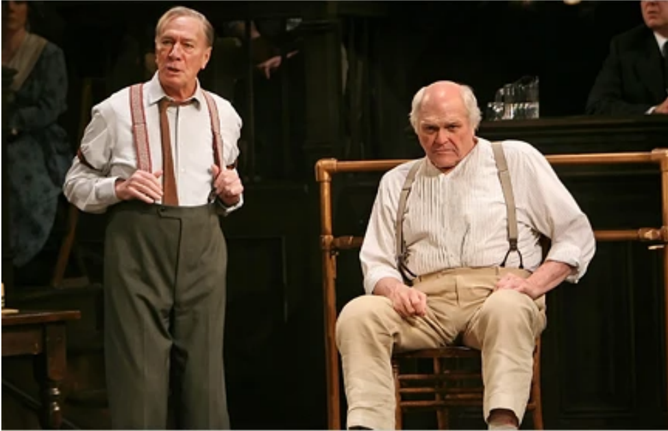
Christopher Plummer, left, and Brian Dennehy in a 2007 production of Inherit the Wind . You will be reading the script of this play for the short essay assignments in this course.