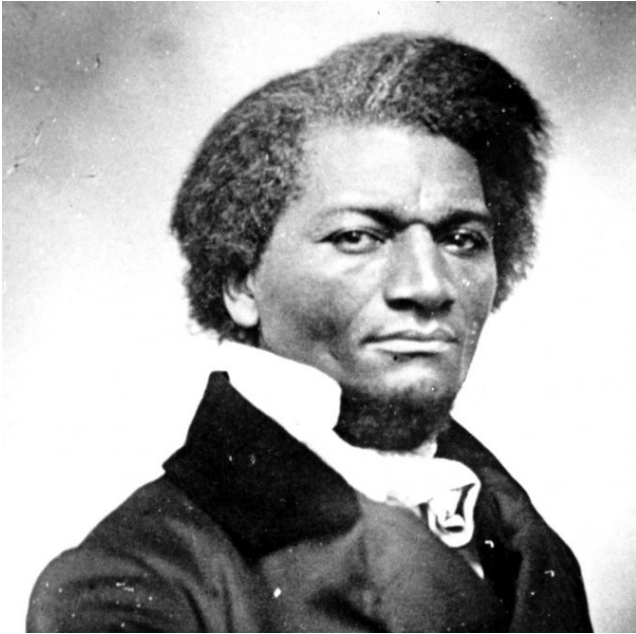
An undated photograph of Frederick Douglass. You will be reading Douglass' autobiography for the short essay assignments in this course.

the full 30 points for attendance. Each additional unexcused absence after three will result in a deduction of 10 points per class from your point total in the course. Absences do not relieve students from the responsibility for missed assignments and exams. Students must take the initiative in arranging with me to make up missed work resulting from an absence, including in the cases of officially excused absences and emergencies.