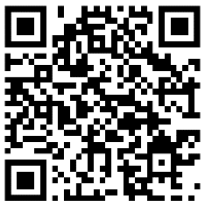
Academic Integrity Policy