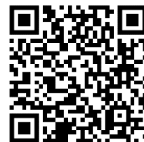
Title IX Policy

requires that any report made to a faculty member, TA, or GA regarding sexual misconduct or gender discrimination must be reported to the Office of Equal Opportunity and the Title IX Coordinator. For more information on this policy, https://policy.unm.edu/university-policies/2000/2740.html or scan the QR Code at right: