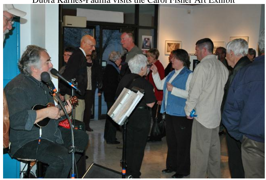
Looks like all is enjoying at the Art Gallery Reception