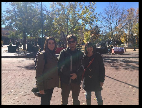
Enjoying our beautiful state capital!