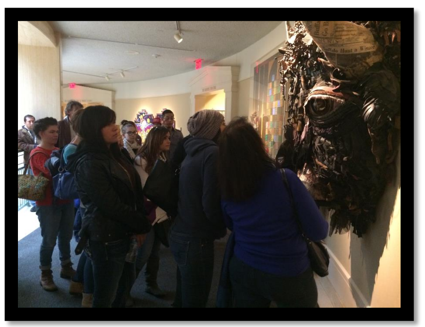
Checking out art in the Round House