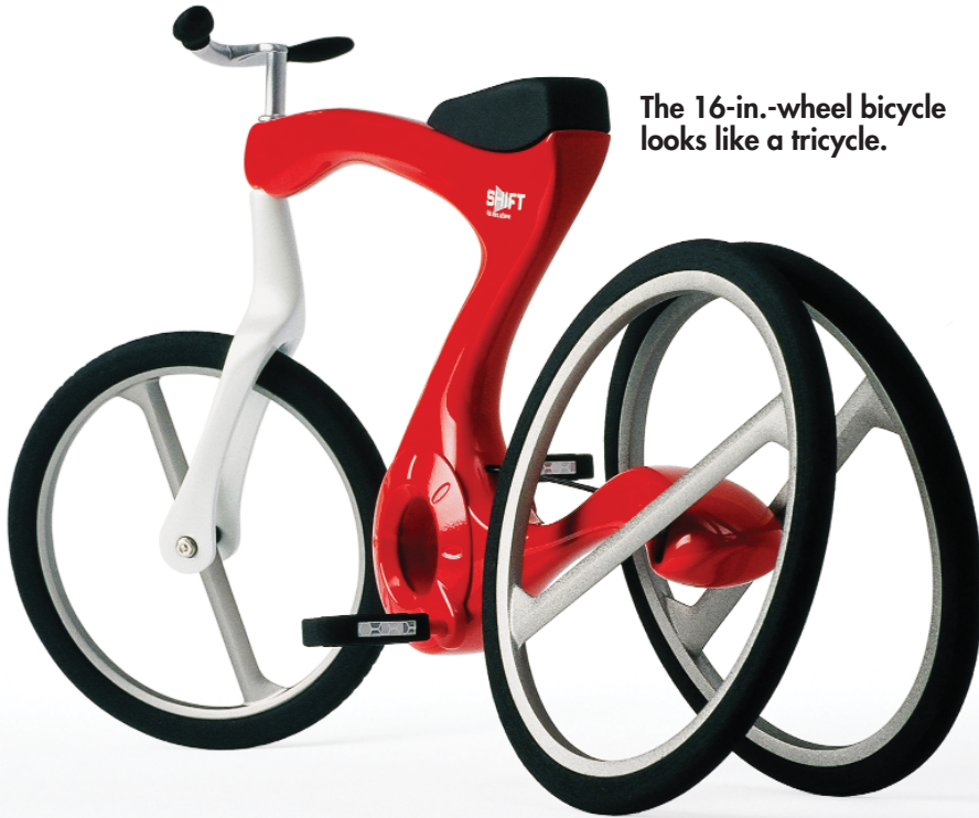
The 16-in.-wheel bicycle looks like a tricycle.

A new bike for beginning riders may replace the parent who usually runs alongside. An industrial design professor and two students at Purdue University created the bike, called Shift.