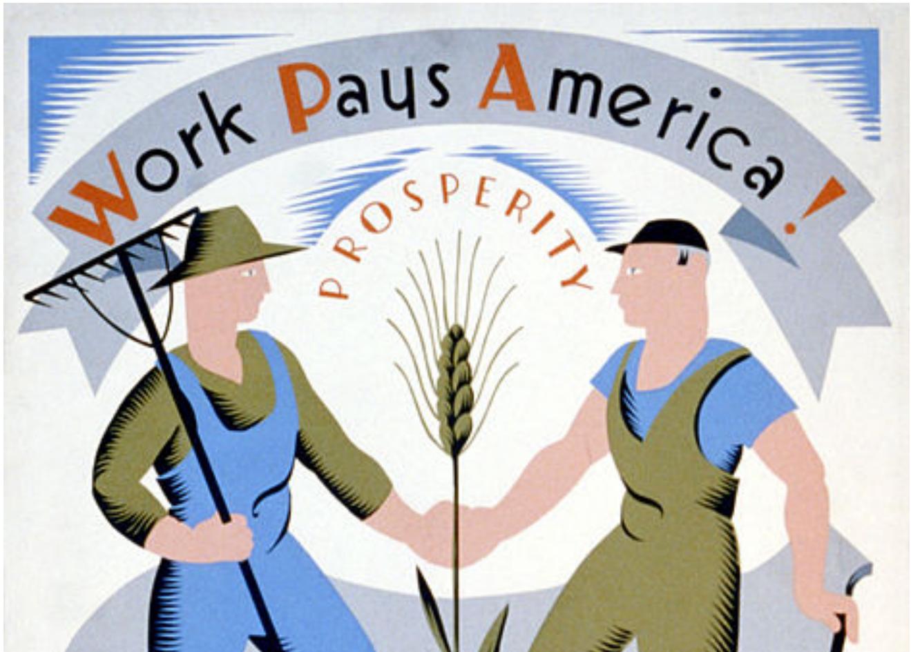
A poster produced by the Works Progress Administration during the Great Depression.

Course: HIST 1120: United States History II